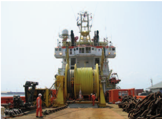
→ MOHO BILONDO FPU Project