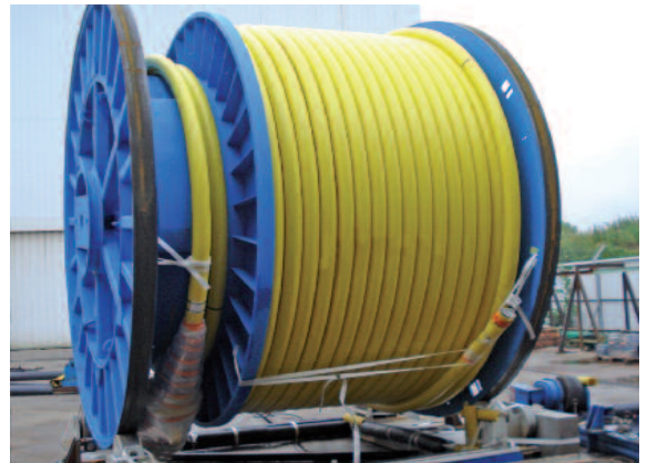
→ NAN FA XIAN FPSO Refurbishment Project